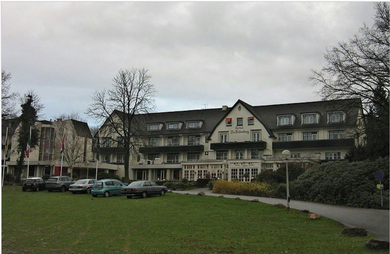
Hotel de Bilderberg, name-giving location of the first meeting in 1954

The Bilderberg Group's first meeting was held in Hotel de Bilderberg , near Arnhem in Holland, from 29 May to 31 May 1954.