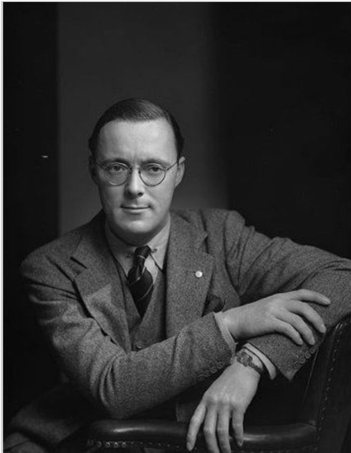
Prince Bernhard of Lippe-Biesterfeld, 1942

together with the aim of stimulating ' Atlanticism ' – better understanding between the cultures of the U.S. and Western Europe to bolster partnership on economic, political and defense matters.