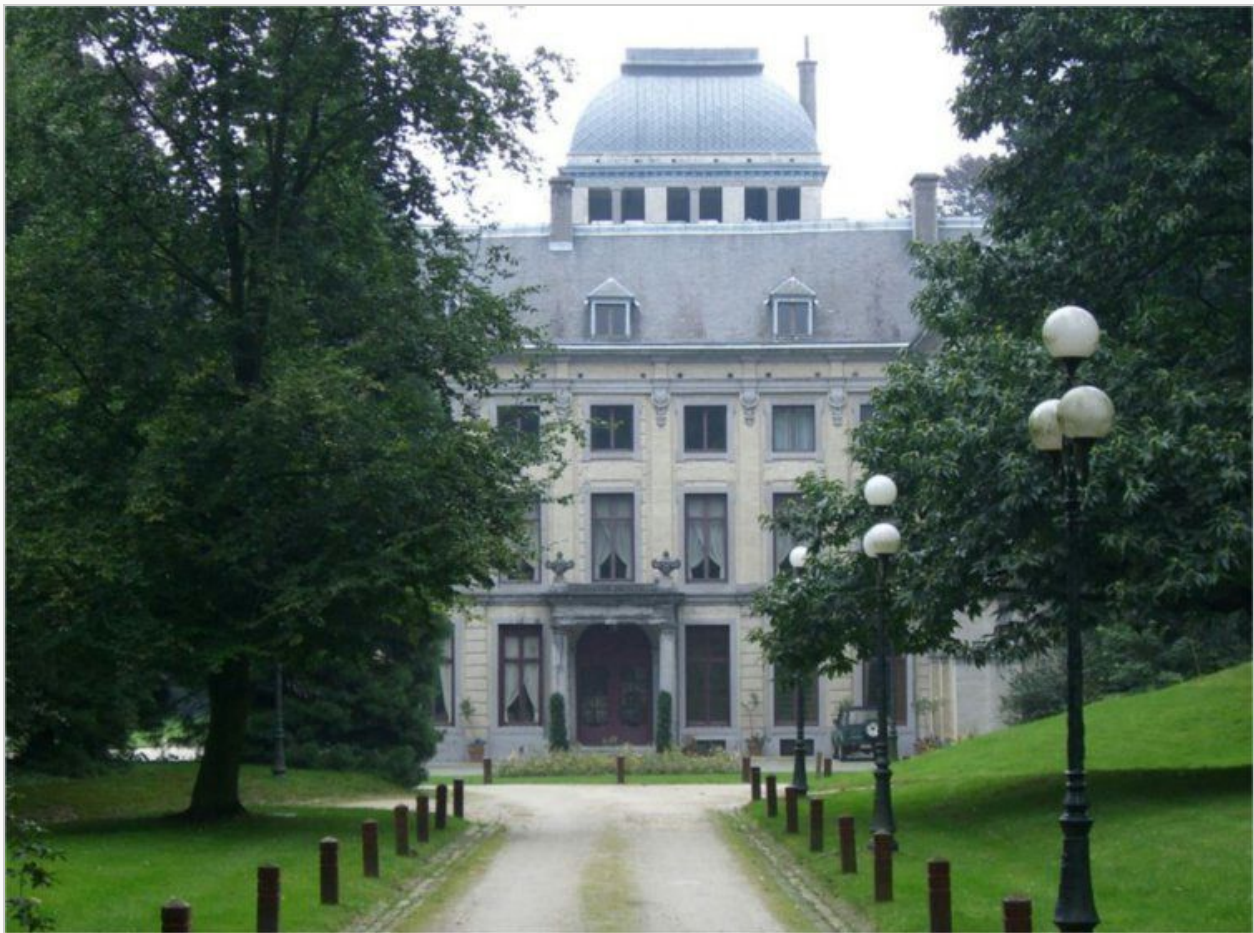
Castle of the Valley of the Duchess, Brussel

Members of Royal families, such as Queen Beatrix of the Netherlands and Juan Carlos I of Spain, have also attended conferences. In recent years, corporate leaders from many large businesses have visited meetings, such as Xerox, Royal Dutch Shell, IBM and Nokia.