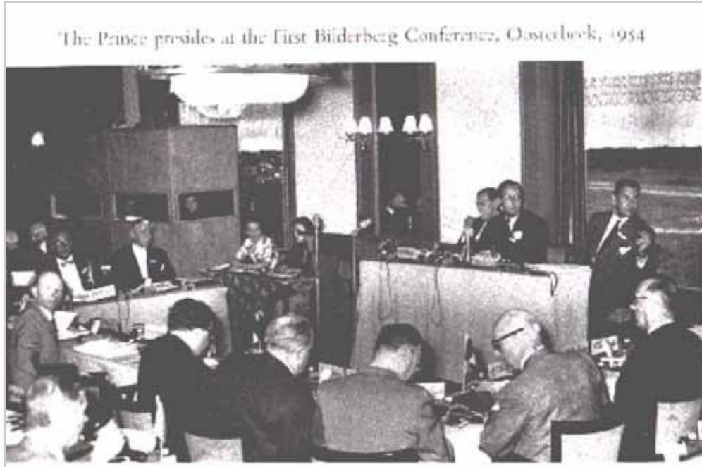
Bilderberg Conference in 1954

The success of the conference led the organizers to arrange a yearly meeting. A permanent Steering Committee was created, with Retinger chosen as permanent secretary. As well as organizing the meeting, the steering committee also registered a list of member names and contact information, with the aim of making an informal network of people who could contact each other in a private capacity.